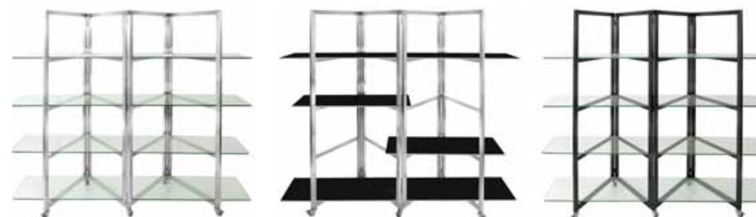
GLASS SHELVES/ STAINLESS STEEL FRAME MODEL #ST1880G