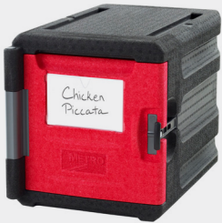
ML180XL 5 Pan Top-loader