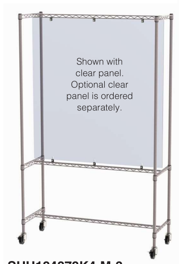
SHH184878K4-M-3 w/ optional clear panel

Metro barrier shields and stands offer a sturdy, portable mounting surface for clear polymer panels. You can easily configure the space to fit the safety requirements of today, and adapt the product in the future to satisfy changing needs.