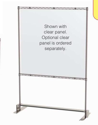
SHS4874K4-S w/ optional clear panel